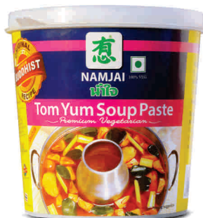
Veg Tom Yum Soup Paste