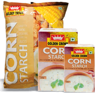
Corn Starch 1 kg / 500 g / 100 g