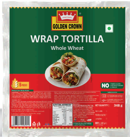
Wrap Tortilla Whole Wheat (348 g)