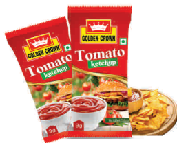
Tomato Ketchup Sachet 9 g