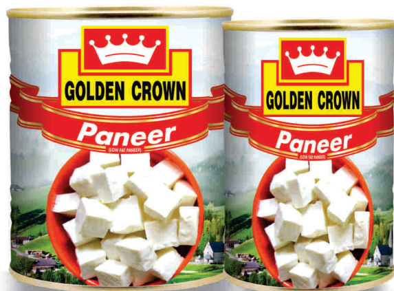
Paneer 825 g / 450 g