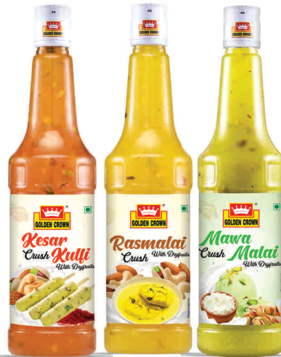
Packing 12 X 750 ml - Kesar Pista / Rasmalai / Mawa Malai