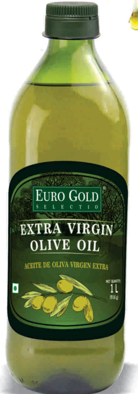
Olive Pomace Oil 5 L/1 L, Extra Virgin Olive Oil 1 L