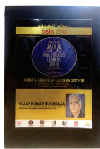
INDIA'S GREATEST LEADERS 2017-18