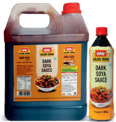
Dark Soya Sauce 5 kg / 800 g