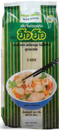
Rice Stick 3 MM 500g