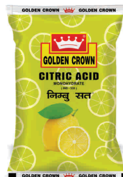
Citric Acid (Small Crystal) 500 g

Hi , you can easily identify the authenticity of Golden Crown MSG by scanning the QR Code on the packet . Just scratch the Hologram and scan the complete QR code to verify .