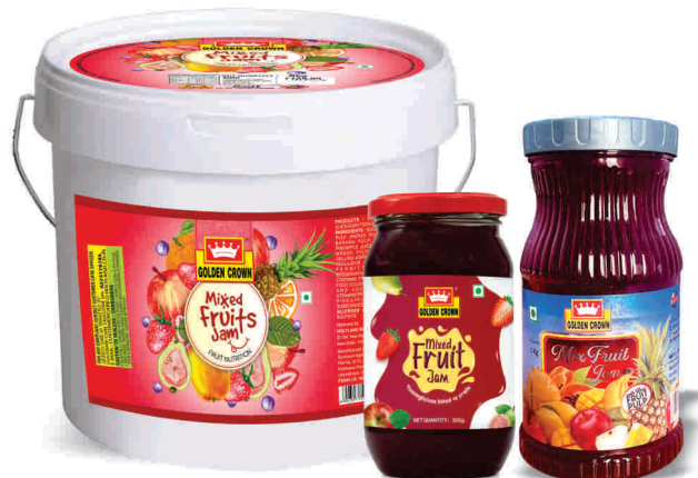
Mixed Fruit Jam 5 kg / 1 kg / 500 g