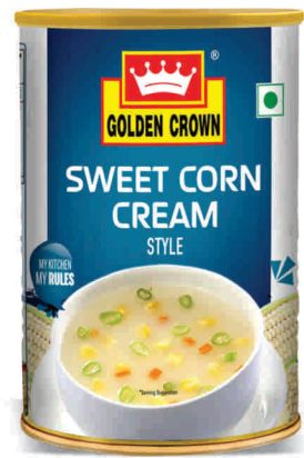
Sweet Corn Cream Style 450 g (With White Corn)