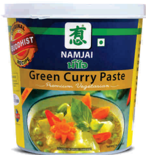
Veg Green Curry Paste