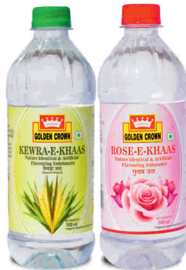
Kewra Water 500 ml Rose Water 500 ml