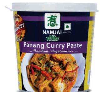
Veg Panang Curry Paste