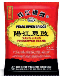
Preserved Beans 500 g