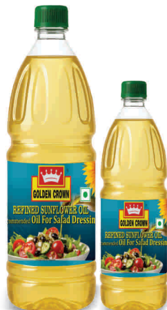
Salad Oil (Sunflower Oil) 1 ltr / 500 ml