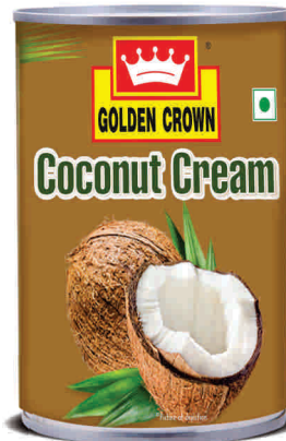
Coconut Cream 400 g