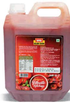
Tomato Ketchup 5 kg Professional