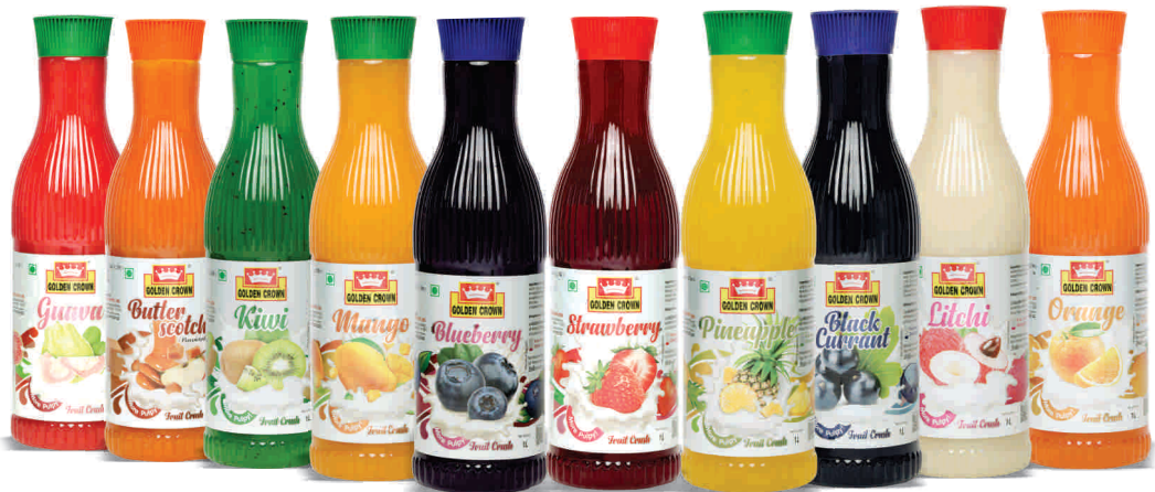
Packing 12X1 Ltr. - Guava/Butter Scotch / Kiwi / Mango/ Blueberry Strawberry/Pineapple / Black Currant / Litchi / Orange