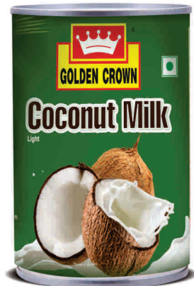
Coconut Milk (Light) 400 g