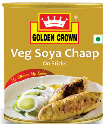
Veg Soya Chaap 850 g