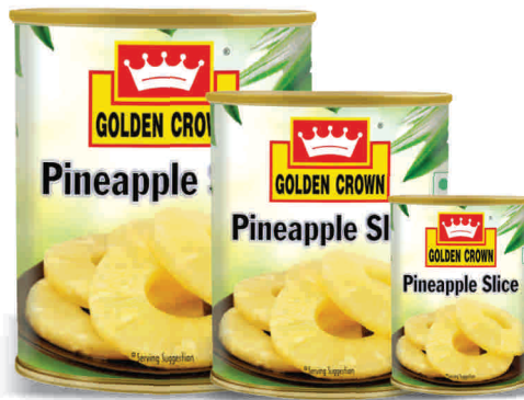
Pineapple Slice in Syrup 3.1 k / 850 g / 450 g