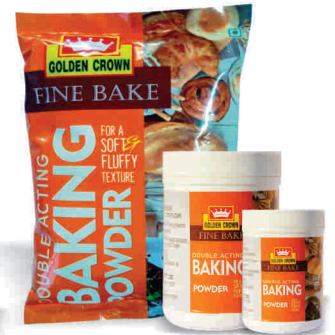
Baking Powder 1 kg / 400 g / 100 g