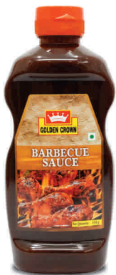
Bar-B-Q- Sauce 510 g