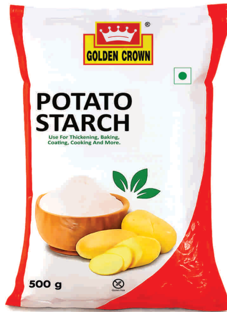
Potato Starch (500 g)