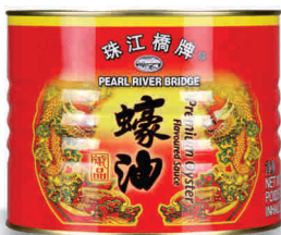
Premium Oyster Flavoured Sauce 2.27 kg / 510 g