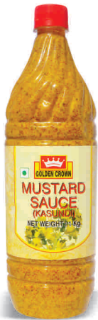
Mustard Kasundi 1 kg