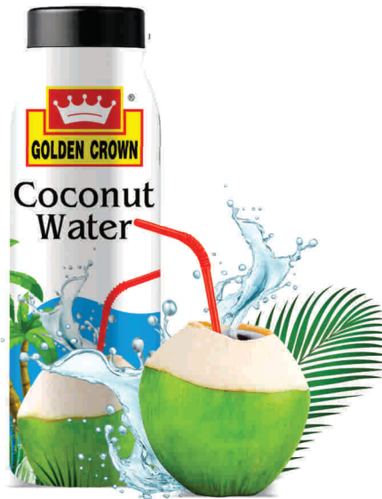
Coconut Water 200 ml