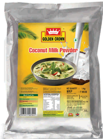
Coconut Milk Powder 1 kg