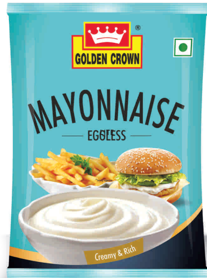
Mayonnaise Lite 15% Fat (1 kg)