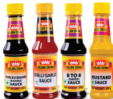
Packing 200 g Worcestershire Sauce / Chilli Garlic Sauce 8 to 8 Sauce / Mustard Sauce