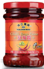
Chilli Bean Paste 230 g