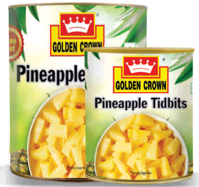
Pineapple Tidbits in Syrup 3.1 Kg / 850 g