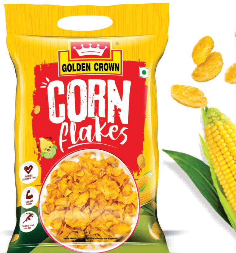
Corn Flakes 500 g