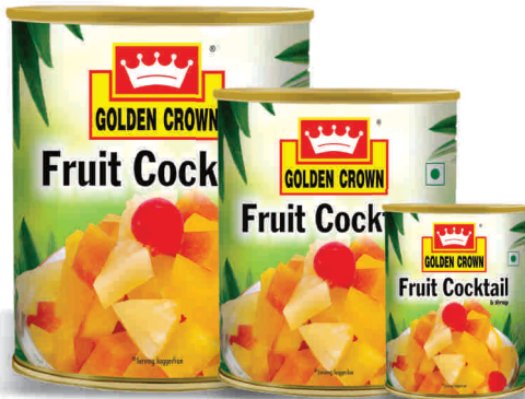
Fruit Cocktail in Syrup 3.1 kg / 850 g / 450 g