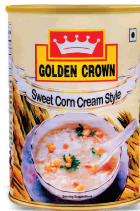
Sweet Corn Cream Style 450 g (With American Corn)