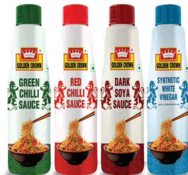
Green Chilli / Red Chilli- 640g, Dark Soya Sauce- 725g, Synthetic White Vinegar- 630ml,