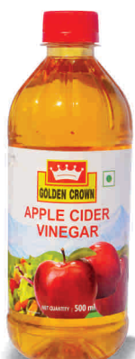
Apple Cider Vinegar 500 ml