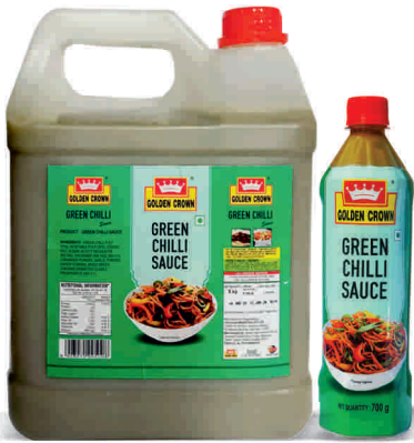
Green Chilli Sauce 5 kg / 700 g