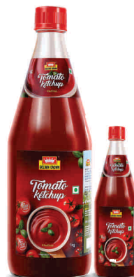
Tomato Ketchup 1 kg / 200 g