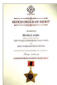
Top 10 Safe Food Projects in india