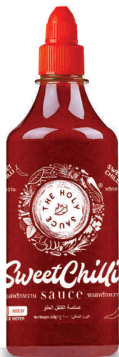
SWEET CHILLI SAUCE 600g