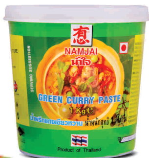
Non. Veg Green Curry Paste