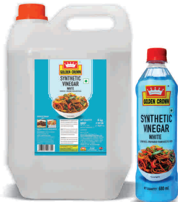
Synthetic White Vinegar 5 kg / 680 ml