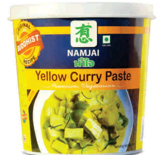
Veg Yellow Curry Paste