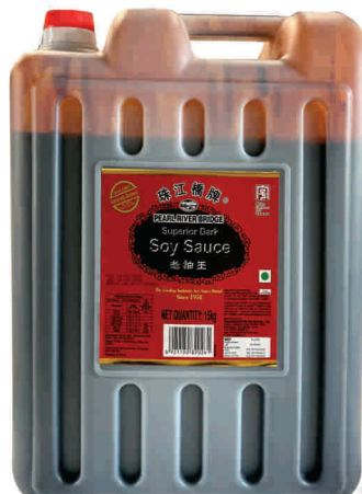
Superior Dark soy Sauce 15 Kg / 500ml (640 g)