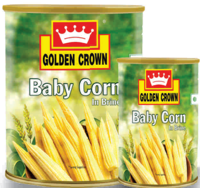
Baby Corn in Brine 850 g / 450 g