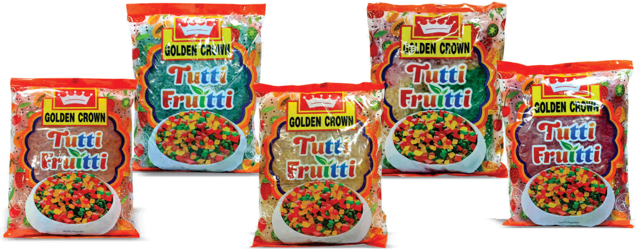
Tutti Fruitti (Red / Yellow / Green / Tricolour / Orange) / 1 kg