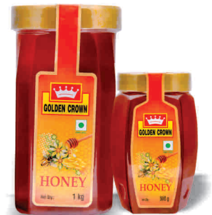
Honey 1 kg / 500 g