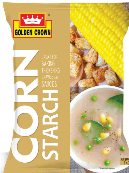
Corn Starch (1 Kg)