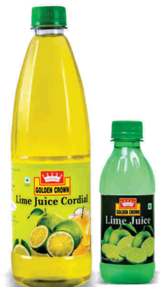
Lime Juice Cordial 700ml / Lime Juice 250 ml