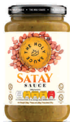
SATAY SAUCE 200 g