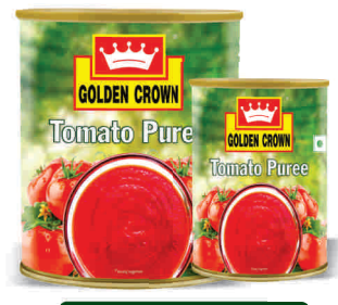
Tomato Pure 825 g / 425 g