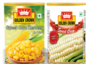
Sweet Corn Kernel in Brine 400 g Sweet Corn Whole Grain 400 g