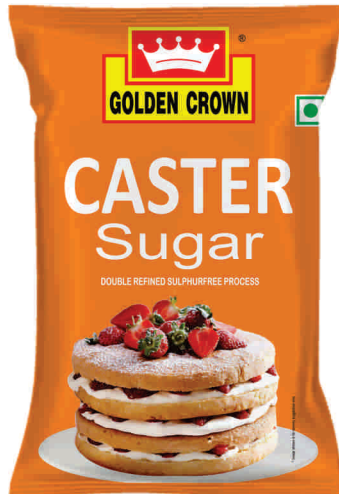
Caster Sugar (1 kg)