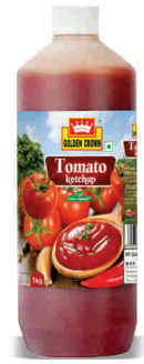
Tomato Ketchup Tombo Chef's Special 1 kg