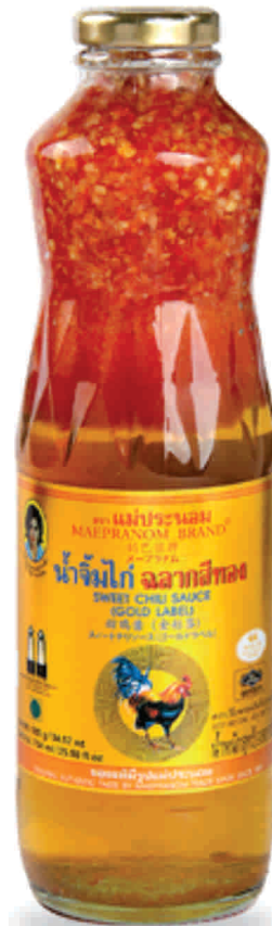
Thai Chilli Sauce (Gold Label) 980g