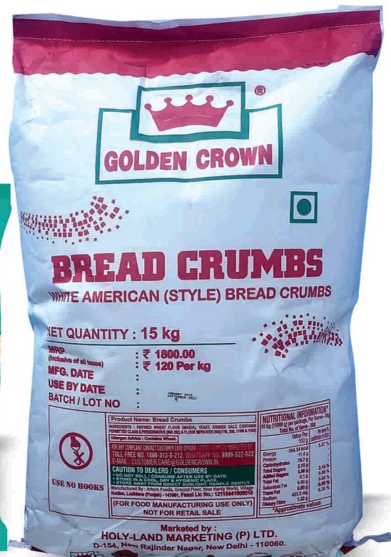
Bread Crumbs American Style 1 kg/15 kg