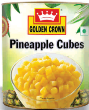
Pineapple Cube in Syrup 3.1 kg