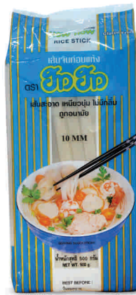
Rice Stick 10 MM 500g