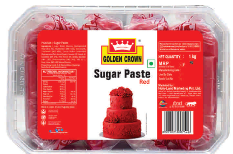
Sugar Paste Red ( 1 kg)