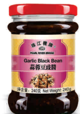
Garlic Black Bean Sauce 240 g