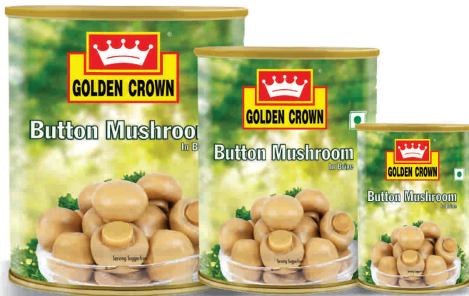
Button Mushroom in Brine 3kg / 800 g / 400 g