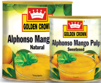
Mango Pulp Alphonso 3 kg / 850 g