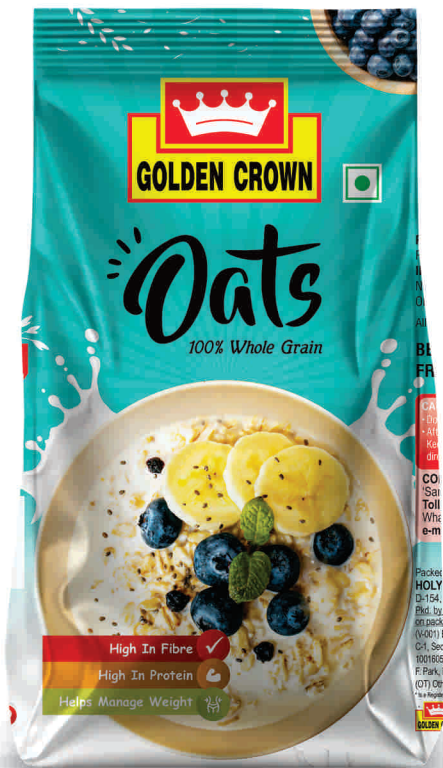
Oats 500 g