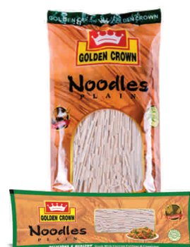
Noodle / 1kg / 400g