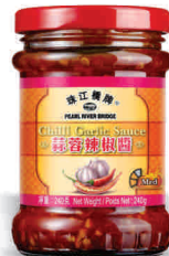
Chilli Garlic Sauce 240 g