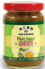
Plum Sauce 230 g