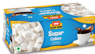
Sugar Cubes 500 g