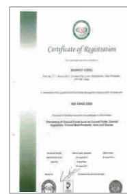
ISO Certified Food processing units