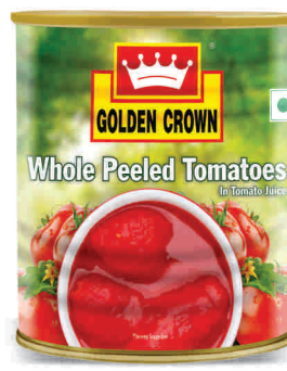
Whole Peeled Tomato 2.65 kg