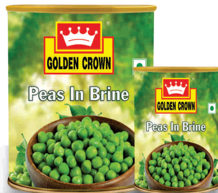
Peas in Brine 800 g / 400 g