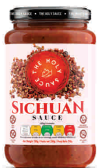
SICHUAN SAUCE 200 g