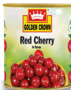
Red Cherry in Syrup 850 g