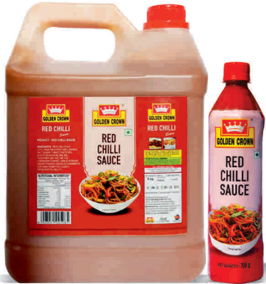
Red Chilli Sauce 5 kg / 700 g