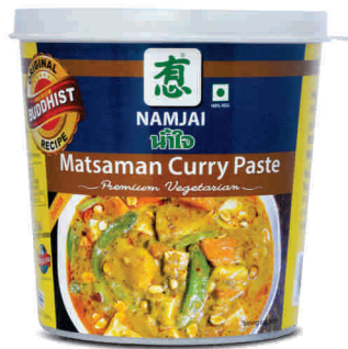
Veg Matsaman Curry Paste