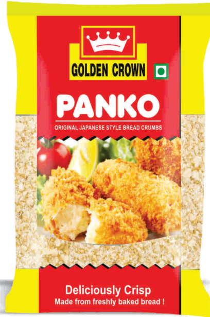
Panko Bread Crumbs 1kg