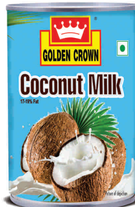
Coconut Milk (17-19% Fat) 400 g