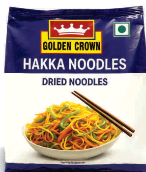
Hakka Noodles 1 kg (1.2mm)