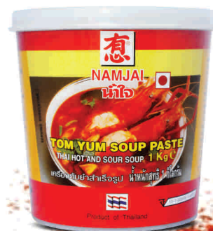
Non. Veg Tom Yum Soup Paste