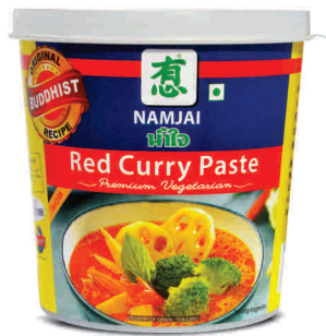
Veg Red Curry Paste