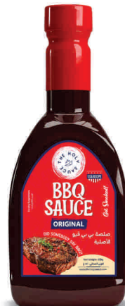
BBQ SAUCE ORIGINAL 510 g