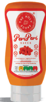
PERI PERI SAUCE 275g