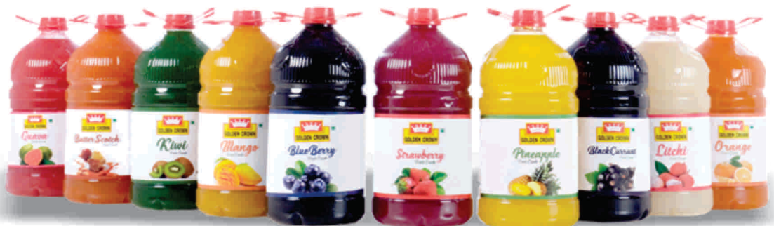
Packing 2X5 Ltr.