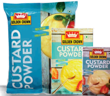
Custard Powder 1 kg / 500 g / 100 g