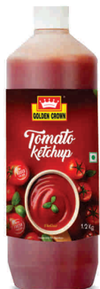
Tomato Ketchup Tombo Professional 1.2 kg