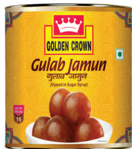
Gulab Jamun 1 Kg