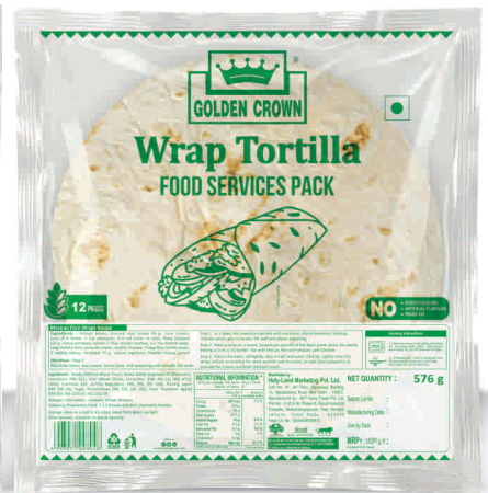
Wrap Tortilla Plain (576 g)