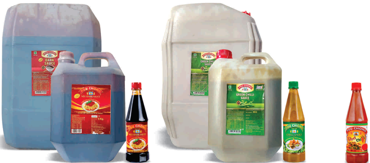
Pouchong Soya Sauce 700 g / 5 Kg & 25 Kg

Red Chilli Flakes 1 kg / Oregano 1 kg / Rosemary 500 g / Basil 500 g / Parsley 500 g / Thyme 500 g Sachet Oregano Spice Mix 0.8 g / Sachet Red Chilli Flakes 0.8 g