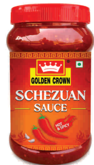
Schezwan Hot Chutney 1 kg (Pet Jar)