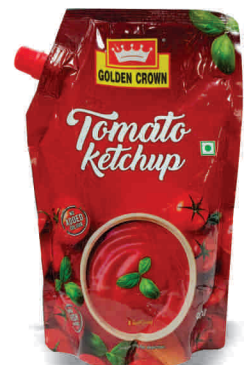
Tomato Ketchup Doypack 900 g