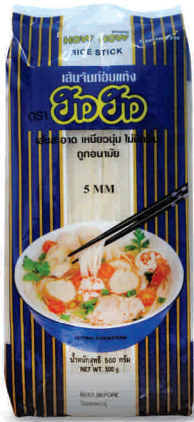
Rice Stick 5 MM 500g