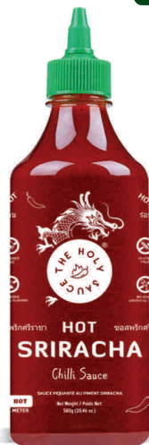
HOT SRIRACHA CHILLI SAUCE 580 g