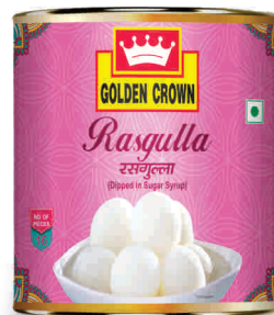
Rasgulla 1 Kg