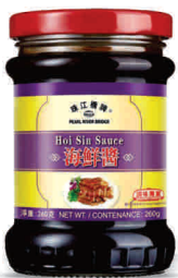
Hoisin Sauce 260 g