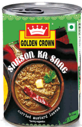
Sarson Ka Saag 450 g