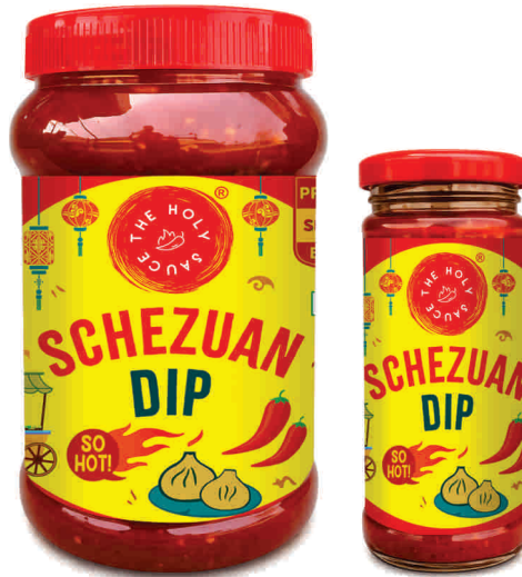
Schezuan 1 kg Schezuan 220 g