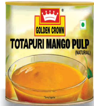
Mango Pulp Totapuri 3 kg