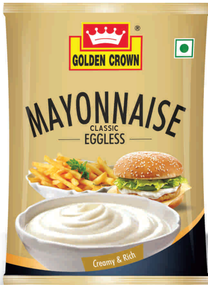
Mayonnaise Classic 25% Fat (1 kg)