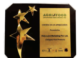
AGRI FOOD Empowering India Awards 2021 Certificate of Appreciation