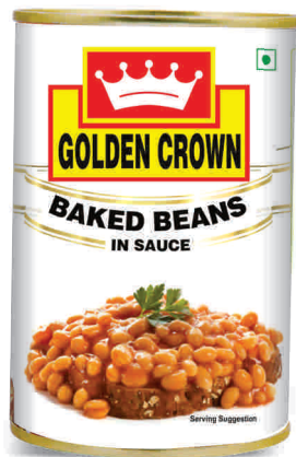
Baked Beans in Sauce 450 g