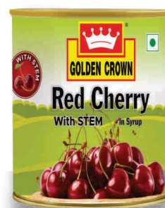
Red Cherry With Stem 800 g