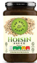
HOISIN SAUCE 200 g