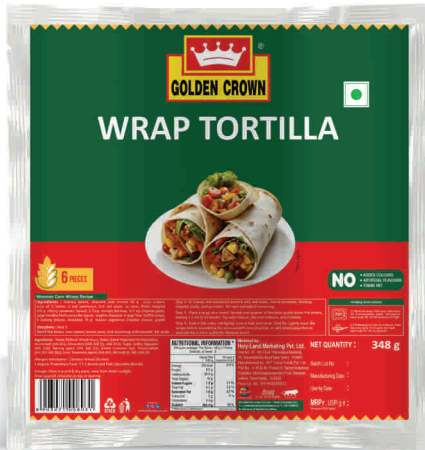
Wrap Tortilla (348 g)