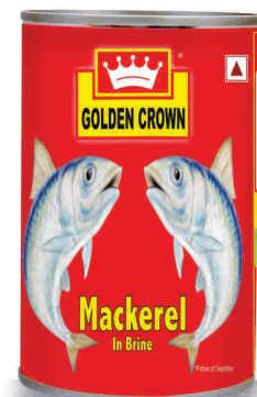
Mackerel in brine 400 g