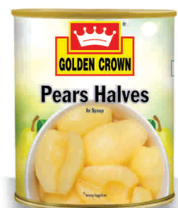
Pears Halves in Syrup 850 g