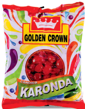
Karonda 1 kg