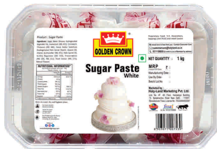
Sugar Paste white ( 1 kg)