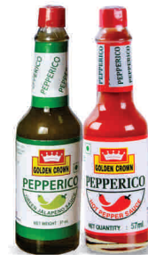
Pepperico Hot Pepper Sauce 57 ml Pepperico Green Jalapeno Sauce 57 ml