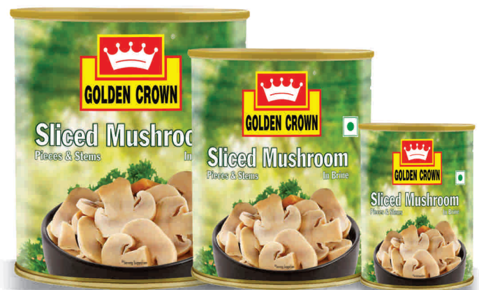
Sliced Mushroom in Brine 3kg / 800 g / 400 g