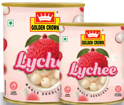
Lychee in Syrup 2.9 Kg / 850 g