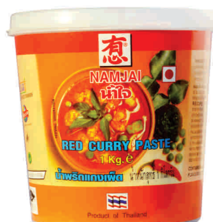
Non. Veg Red Curry Paste