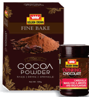
Drinking Chocolate / 500 g / 100 g Cocoa Powder / 100 g / 50 g