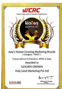
ASIA'S Fastest Growing Brands FMCG EDITOR : KPMG