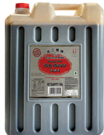
Superior Light soy Sauce 15 Kg / 500ml (570 g)