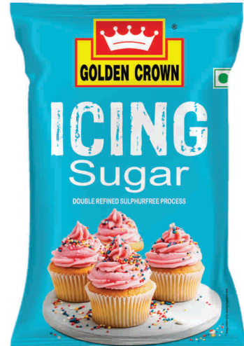
Icing Sugar (1 kg)