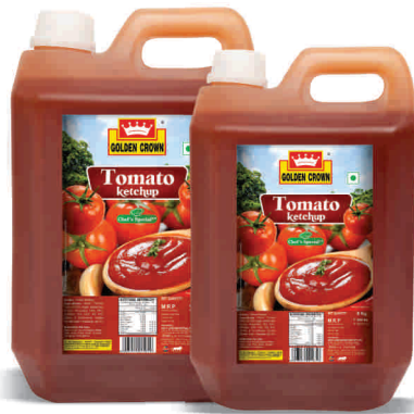
Tomato Ketchup 6 kg / 5 kg Chef's Special