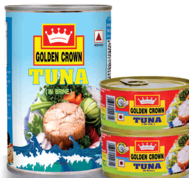
Tuna in Brine / Tuna in Oil 400 g / 180g