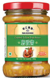
Crushed Yellow Bean Sauce 260 g