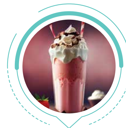
VALUE ADDED BEVERAGES