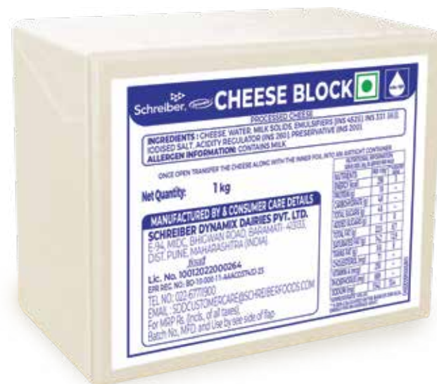
HIGH MELT - HARD